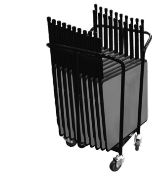
Folding Exam Square Desk Trolley