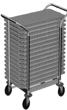
Folding Exam Rectangle Desk Trolley