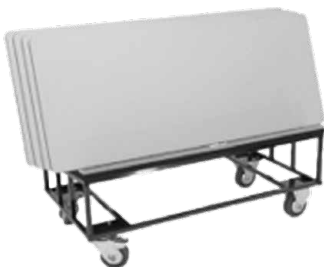
DuraLite Table Trolley