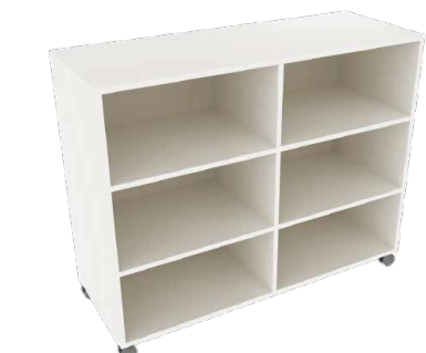
Straight Bookcase 900mm