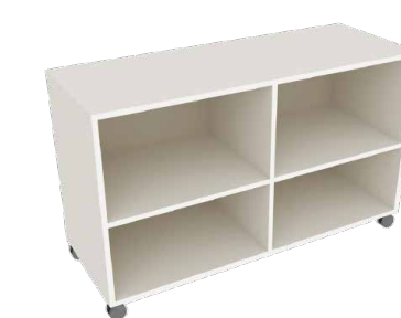
Straight Bookcase 720mm