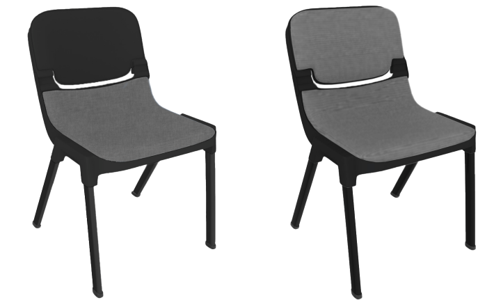
Progress Chair with Padded Seat