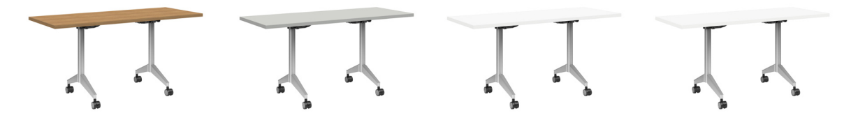
Sublime Teak Oyster Grey Polar White White Writeable