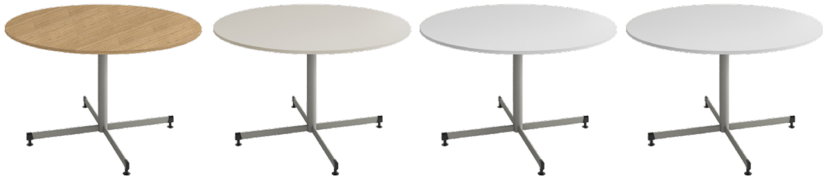
Sublime Teak Oyster Grey Polar White White Writeable