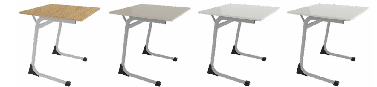
Sublime Teak Oyster Grey Polar White White Writeable