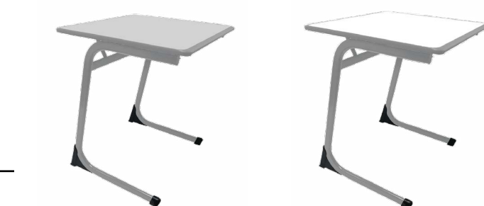
Fog Grey White Writeable