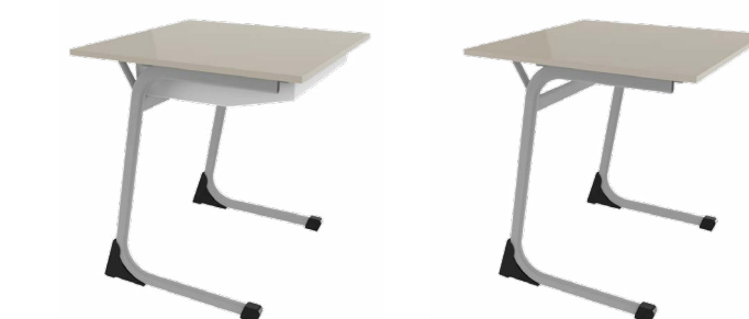
With drawer Without drawer