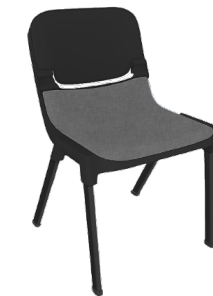
Progress Chair with Padded Seat