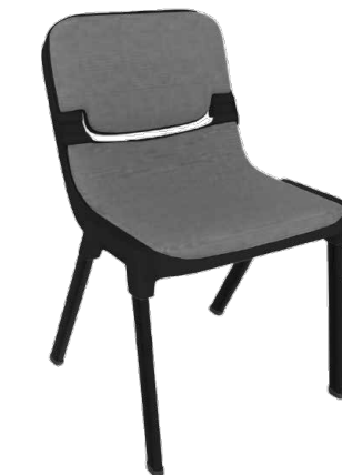
Progress Chair with Padded Seat and Back