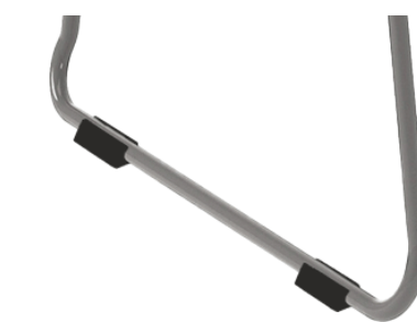
Black Rubber Glides