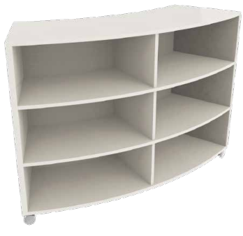
Curved Bookcase 900mm