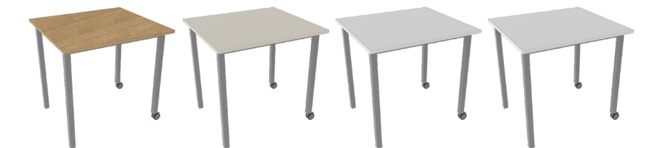
Sublime Teak Oyster Grey Polar White White Writeable