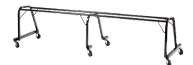
Postura Plus 4 Seat Auditto Trolley