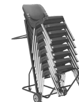
Progress Chair Trolley