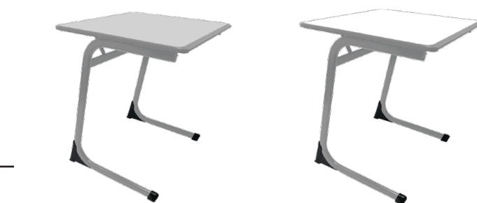
Fog Grey White Writeable