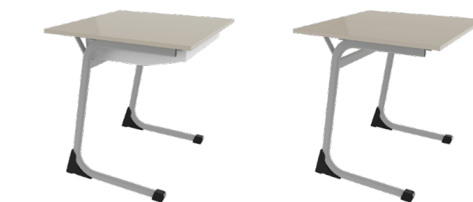
With drawer Without drawer