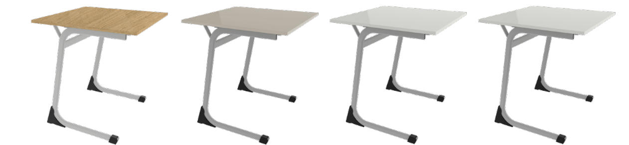
Sublime Teak Oyster Grey Polar White White Writeable