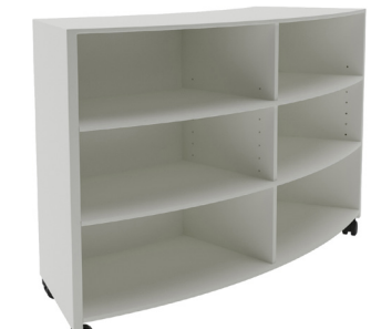
Smart Curved Bookcase 905mm