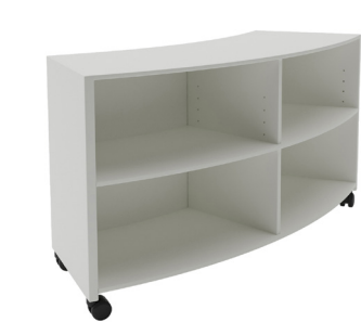
Smart Curved Smart Bookcase 725mm